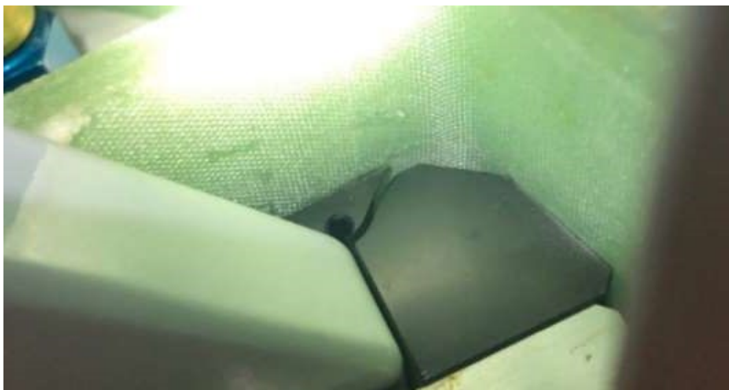
Figure 2 - Cracked MLG Support Plate (Polyamide Insert)